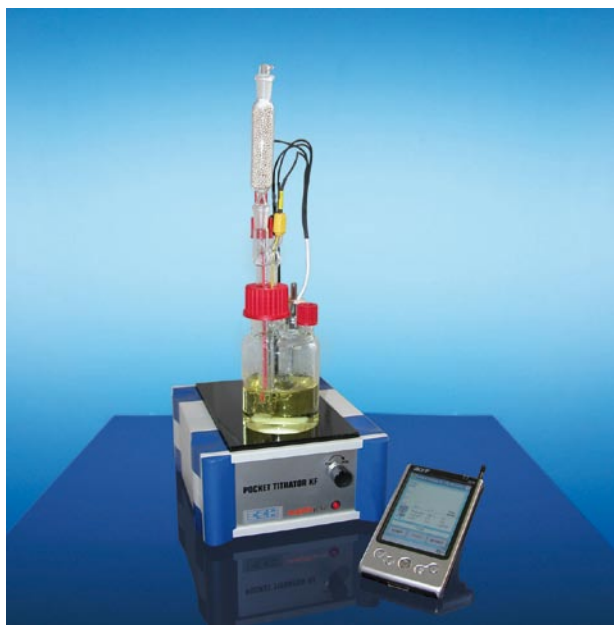
▲ Pocket-Titrator with space-saving PDA